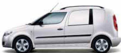
Candy White uni