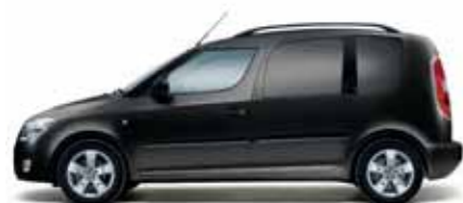
Black Magic pearl effect