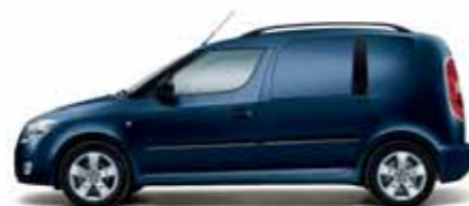
Pacific Blue uni