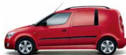
Corrida Red uni